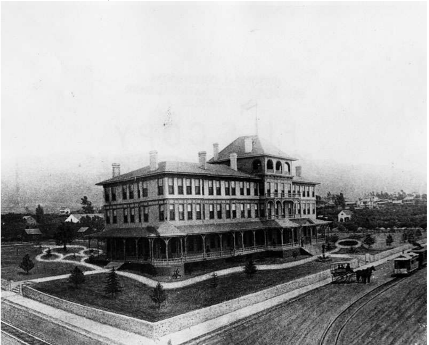
View facing northeast